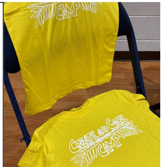
Right: Shirts: Screen printing is a fun and relatively easy activity. Now that St. John has the supplies, perhaps we'll be seeing this activity again!