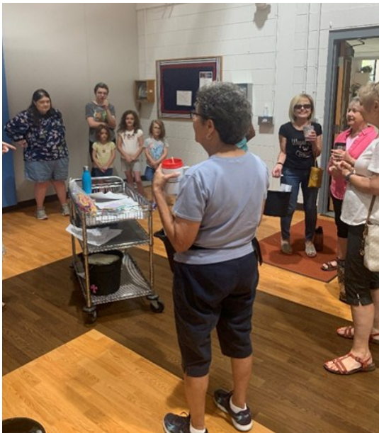
Left: Volunteers 1: Monday morning plan of action. Our volunteers showed up ready to get to it, and get to it they did!