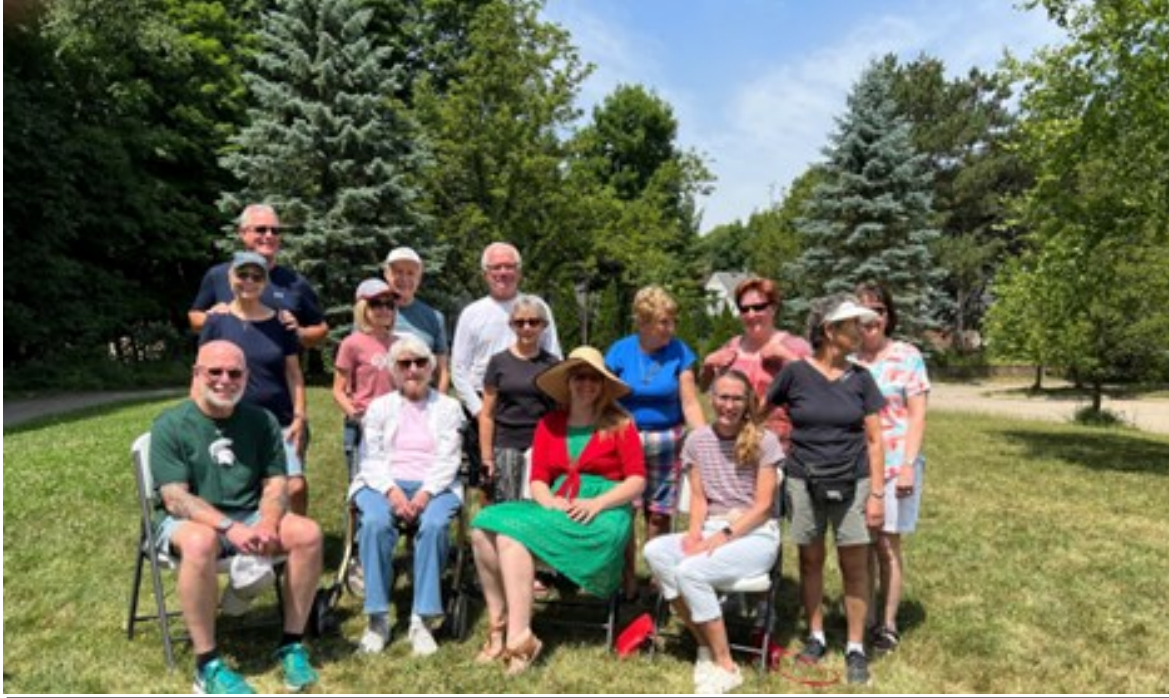
Volunteer Group: The folks who made it all possible! (Minus a few who couldn't be there for the photo).