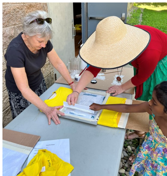
Left: Printing: Most summer kids camps send the kids home with T-shirts. Being a camp with a focus on creating, CCCampers got to screen print their own shirts.