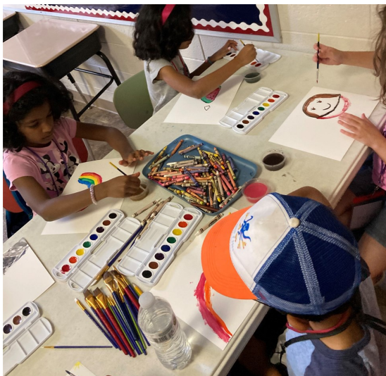
Left: Paint: The fun didn't stop when the campers left, most days saw a flurry of activity to set up for the following day. Seen here are the plant based paints made Thursday night for the art station